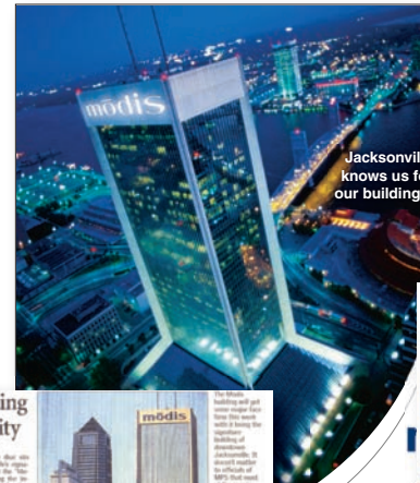
Jacksonville knows us for our building...

Our clients know us as a global leader in IT services.