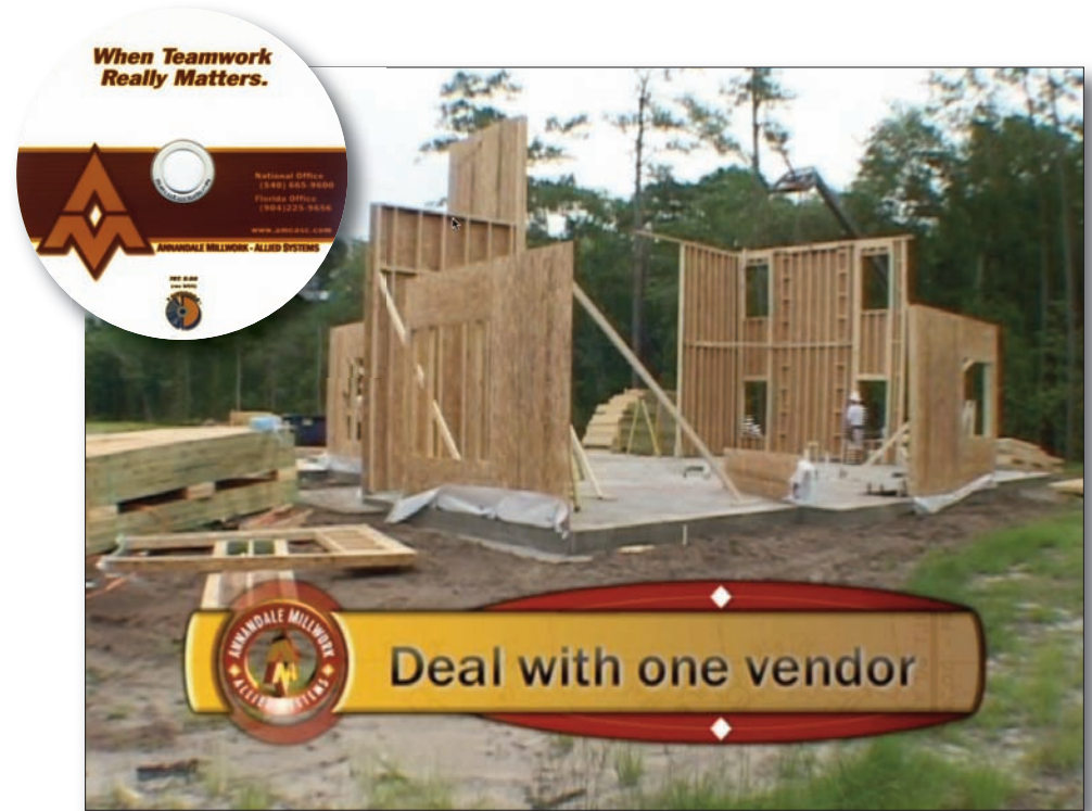
Sales Presentation DVD